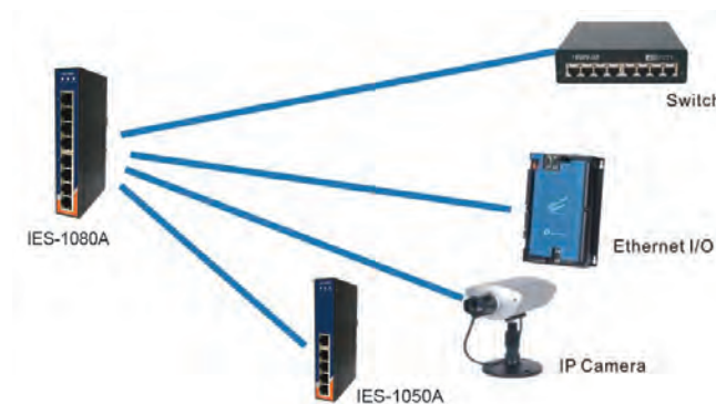
Connections of Ethernet devices

IES-1050A/1080A can be used in connecting several Ethernet devices like Ethernet I/O, IP-Camera or other Ethernet switches. In addition, there are two different power inputs at terminal block to avoid interruption caused by power down. When the primary DC power input fails, the backup power input will take over immediately to guarantee a non-stop operation.