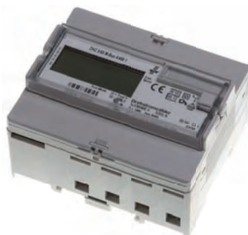
ED 310.DB HWG