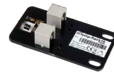
HTemp-1Wire Rack 19